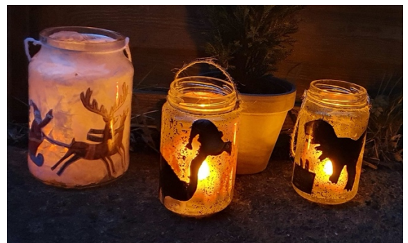
Some of the GlowHome lanterns created by residents of Burnham-on-Sea and Highbridge

Full size Images to accompany this release can be downloaded via: